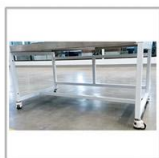
Base Stand Optional